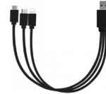
3-INTO-1 USB CABLE